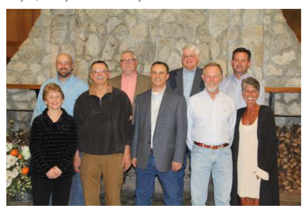
2017 Officers and Board of Directors

Our 46<sup>th</sup> SCAA Banquet and Futurity Sale were two awesome events! So many folks came out to celebrate the occasion, spend time with great producers and friends, eat some wonderful ribeye's, and buy some extraordinary cattle.